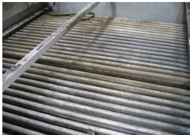
clean cooling tower after 3 years of using ball tech energy Scale Remover model SF-20-04.