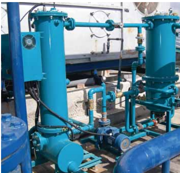
Installation of a Scale Remover model SR-05 with a Send Filter model SF-20-04.